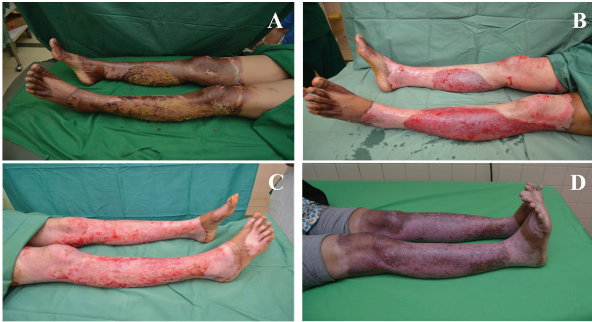
Fig. 1 Bilateral deep-dermal and full-thickness burns on the legs. (A,B) Initial presentation with (B) subsequent photograph after debridement and activated autologous platelet-rich plasma (aaPRP) therapy. (C) A photograph after the second dose of aaPRP on the 14th day. (D) A photograph showing full re-epithelialization of both legs on the 23rd day.

distributed into eight tubes containing sodium citrate and centrifuged at 1,000 rpm for 10 minutes. The plasma portion was drawn and recentrifuged at 3,000 rpm for 10 minutes. The platelet-poor portion was then discarded, leaving a concentrate of 2.5 mL in each tube (with ~8.85 times more platelets than whole blood). Precisely 0.15 mL of calcium activator (H-Remedy, HayandraLab, Indonesia) was added to each tube to activate the PRP, and the subsequent clots were removed. Finally, 10 mL of normal saline was added into each tube, and photoactivation (AdiLight-1, AdiStem Ltd., Hong Kong) was performed afterward. This processing method rendered the aaPRP devoid of leukocytes and platelets, and it was also suitable for subsequent IV administration.