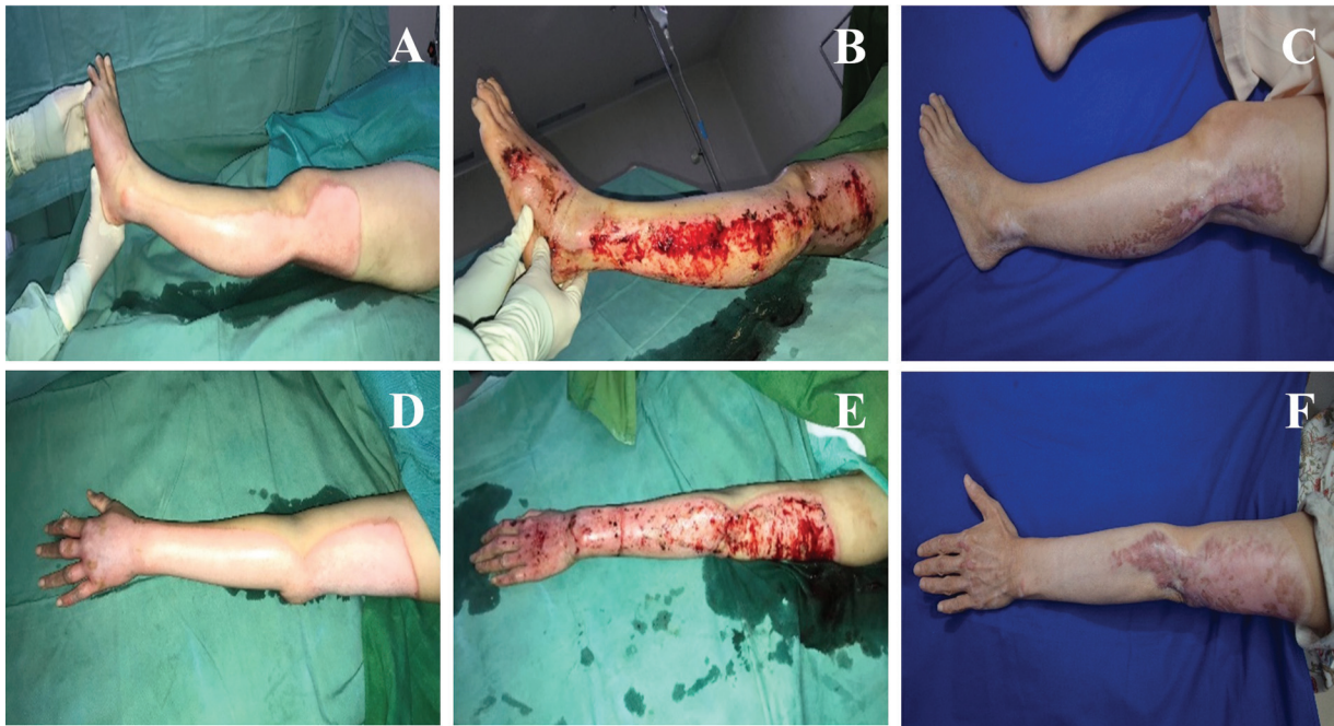
Fig. 3 Deep-dermal and full-thickness burns on the left extremities. Initial presentation at 2 days after injury of the (A) left inferior and (D) superior extremities. A photograph of the patient's (B) left inferior and (E) superior extremities after treatment on the fourth day. Subsequent follow-up of the (C) left inferior and (F) superior extremities at 9 months postinjury showing hypertrophic scarring.