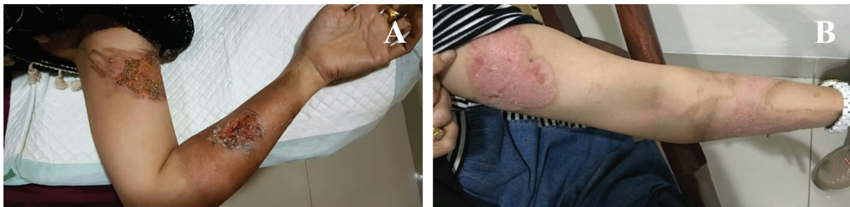
Fig. 4 Mid-dermal burn on the left arm and forearm. (A) Initial presentation with signs of local infection. (B) Return of mobility and complete epithelialization at 13 days postinjury.

6th and 16th days, and nonsurgical debridement on the 10th, 23rd, and 26th days postinjury. The patient was discharged on the same day as the last procedure with a 99% epithelialization rate (► Fig. 6).