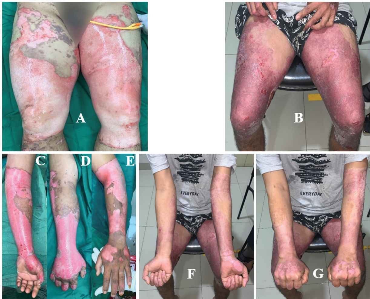
Fig. 7 Deep-dermal and full-thickness burns on the extremities. Initial presentation of a burn injury on the (A) anterior side of both thighs, (C) the anterior side of the left forearm, and (D) the anterior and (E) posterior side of the right forearm. Photographs of the anterior side of (B) both thighs and the (F) anterior side and (G) posterior side of both forearms at 5 days after discharge.

Wound closure is an important factor in burn injuries. Early wound closure reduces the risk of infection, fluid loss, mortality, and hypertrophic scarring. 8 Our previous study in Sprague-Dawley rats with burn injuries showed that intradermal injection of PRP promoted tissue regeneration, although its performance was still inferior in comparison to a PRP–stromal vascular fraction combination. 7 A porcine full-thickness wound model showed that the intrinsic contents of PRP promote extracellular matrix formation and organization, angiogenesis, and re-epithelialization. 9 In cases 1, 2, 4, 5, and 7, intralesional and IV aaPRP therapy resulted in complete wound epithelialization before the fourth week.