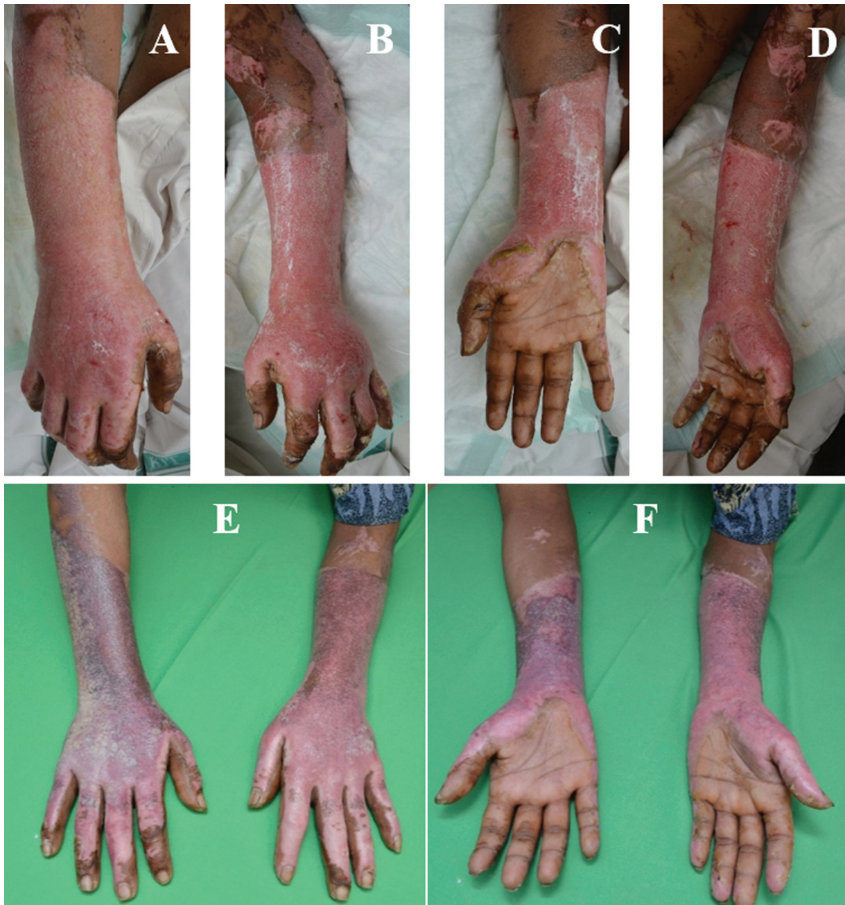
Fig. 2 Bilateral deep-dermal burns on the forearms and hands. The (A) right and (B) left posterior side along with the (C) right and (D) left anterior side of the forearm and hands after treatment on the third day. Full re-epithelialization on the (E) posterior and (F) anterior side of both forearm and hands on the 26th day postinjury.

experienced severe pain (numerical rating scale [NRS] 6) that discouraged her from extending her arm. On the same day, the wound was debrided and was treated with SC and IV aaPRP. On the 13th day postinjury, the patient reported relief from pain, and full epithelialization of the wound was observed (►Fig. 4). Mobility also returned, as the patient's arm could be extended comfortably.