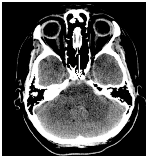
Figure 1 - Head CT demonstrate subarachnoid hemorrhage anterior and lateral to the pons.

Good outcomes are the rule with most series reporting no poor outcomes. Long-term follow-up studies reveal that life expectancy is not altered and rebleeding is exceptional. Patients had residual complaints consisting