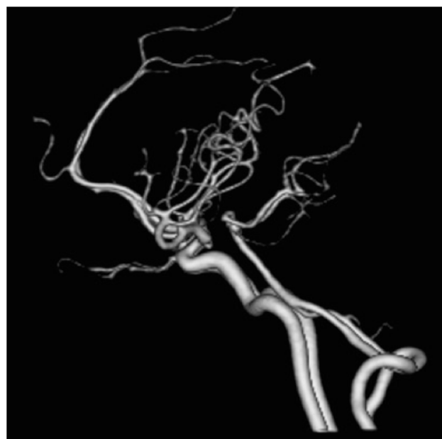
Figure 2 - Lateral view CTA 3D reconstruction done at admission.

of headaches, irritability, depression, forgetfulness, weariness, and diminished endurance. 4,5