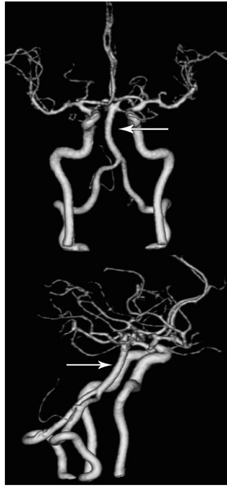
Figure 4 - Anterior-posterior and lateral views CTA 3D reconstruction shows complete resolution of basilar artery vasospasm in response to milrinone therapy.

in reporting angiographic vasospasm (3-20%). These differences can be explained by timing and number of cerebral angiograms performed. When angiographic vasospasm is present, it is usually mild and focal, mainly affecting the posterior circulation, 4,6 but severe and diffuse vasospasm has also been reported. When it occurs, clinical vasospasm is usually transient, associated with mild neurological findings and far less common than that seen radiographic imaging. When clinical or radiological vasospasm is seen in the context of PNSAH, it often follows the angiography itself leading some to believe that it may in fact be a complication of the diagnostic procedure itself. 7