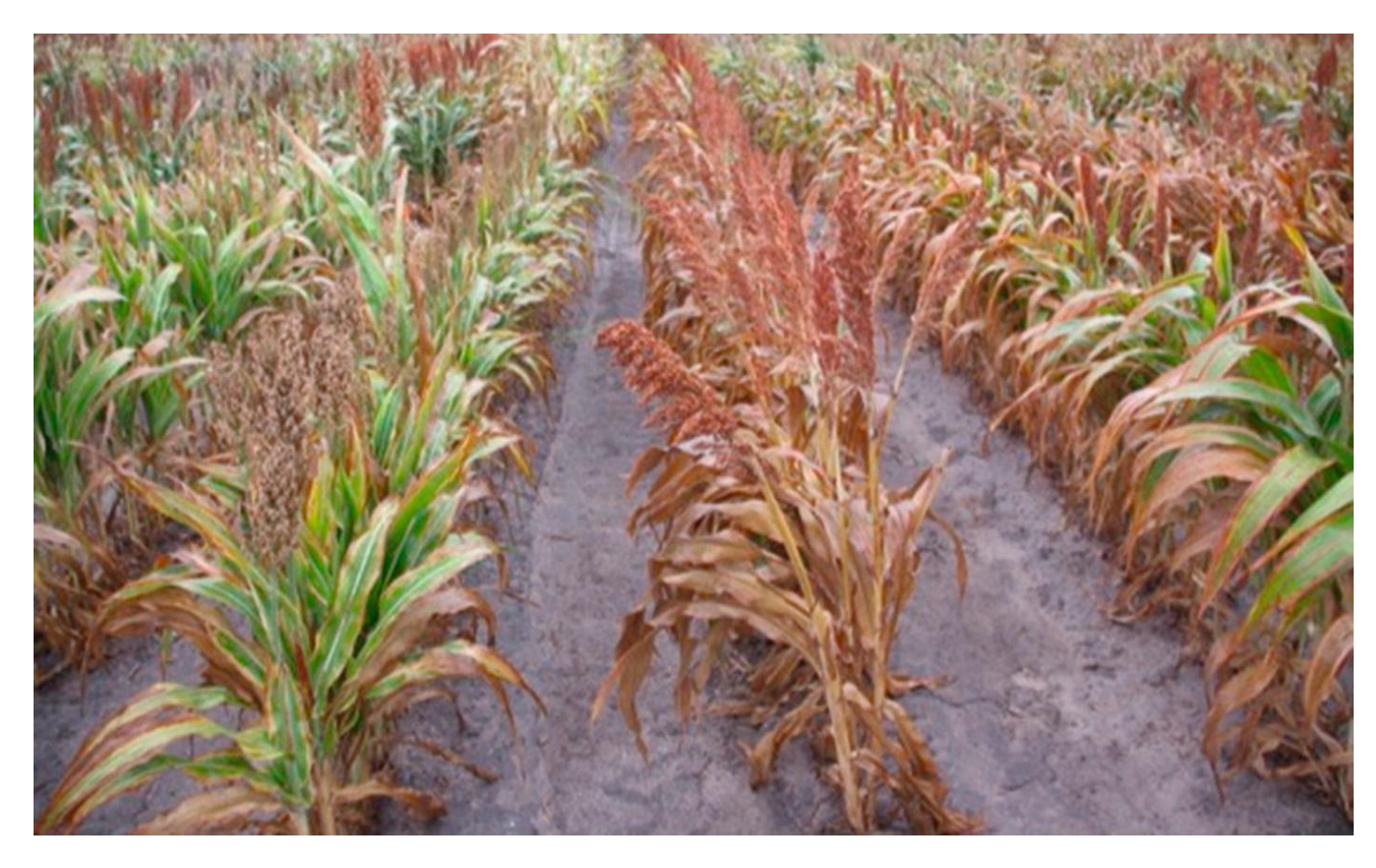
Figure 4. Expression of introgressed stay-green QTLs lines left and unintrogessed lines of sorghum, right, Photo-2019.