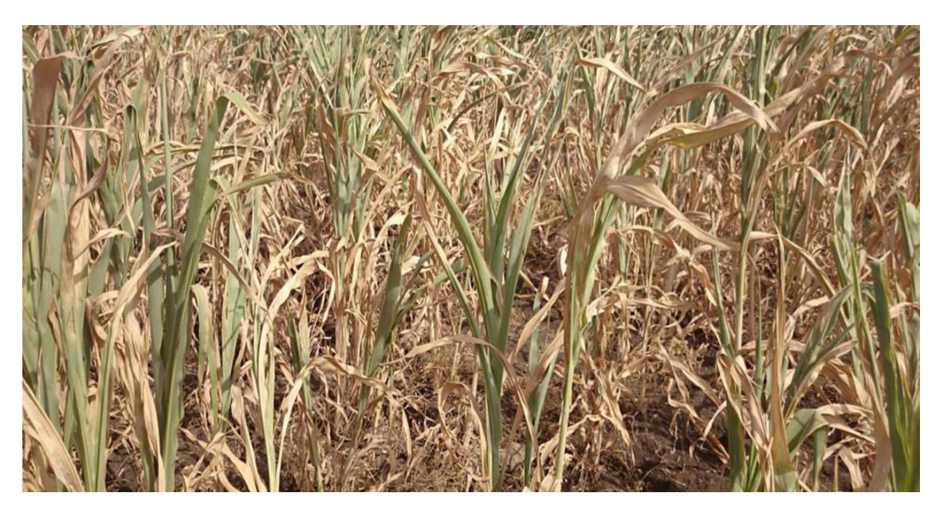
Figure 1. Impacts of drought stress in sorghum in Ethiopia, Photos-January 2016.

ability to maintain leaf greenness differs from one variety to another; nonetheless, retaining of leaf greenness is positively correlated with grain yield [7]. Sorghum, as an important crop to climate resilience, is suitable to smallholder farmers who cannot afford irrigation to sustain food security in Africa and Asia [29]. Climate change has caused unpredictable weather conditions, especially in semi-arid areas where the duration of dry spells has been increasing, which has caused crop wilting, leading to food insecurity. Figure 1 shows the impact of drought stress on sorghum plants in Ethiopia.