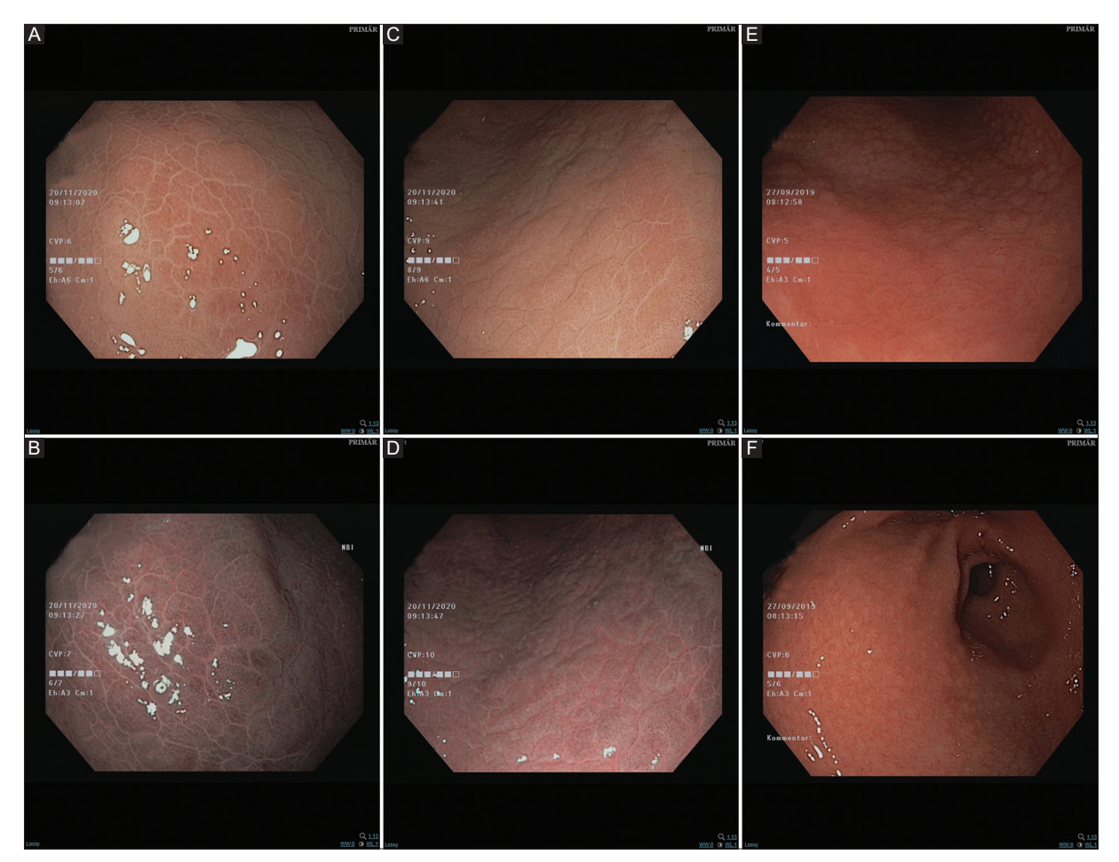
Figure 1 Endoscopic images of patients infected by Helicobacter pylori . (A) White light endoscopy demonstrating an antral region with typical inflammatory lesions of gastric mucosa. (B) same region with narrow-band imaging. (C, D) Corpus localization of the same patient depicting inflammatory mucosal changes with white-light and narrow-band imaging, respectively. (E, F) Typical lesions of pediatric patients depicting antral nodularity. Images were captured with a 190 series Olympus Exera III gastroscope (Tokyo, Japan).

gastritis, gastric atrophy, intestinal metaplasia and neoplasia. Factors that may influence H. pylori detection include the number and site of biopsies, the staining methods and the pathologist's experience [46]. Histological examination of gastric specimens is considered to be the practical diagnostic "gold standard" [47-49], since it offers the highest sensitivity and specificity for the detection of active H. pylori infection (Table 1) and provides additional information regarding the topographic distribution of the bacteria, as well as relevant microscopic lesions. The most commonly used histochemical staining for routine usage is hematoxylin and eosin (H&E), which yields a sensitivity and specificity of 69-93% and 87-90%, respectively [50]. Although the visualization of inflammation is very satisfactory with H&E, in cases with an atrophic epithelium and a low density of H. pylori, H. pylori detection might become challenging. By utilizing special histochemical staining techniques or immunohistochemistry (IHC), including modified Giemsa, Warthin-Starry silver, Giminez, McMullen, Dieterle and Genta staining (Fig. 3), specificity can be further ameliorated to 90-100%. Dieterle and Genta staining combines silver stain, H&E and Alcian blue, and offers the advantage of both visualization of H. pylori and scoring of inflammation [49,50].