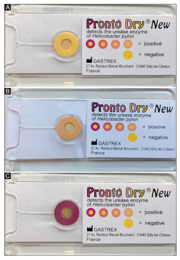
Figure 2 Representative rapid urease test demonstrating the results, typically readable within minutes, of Helicobacter pylori status: (A) negative test (B) mild positive test (C) positive test

Proteus mirabilis, Citrobacter freundii, Klebsiella pneumonia, Enterobacter cloacae, Staphylococcus aureus or Staphylococcus capitis ureolyticus, typically found only in achlorhydria or hypochlorhydria settings [36]. To increase sensitivity, especially in patients with a history of recent or systematic antibiotic or PPI usage, biopsies should be obtained from both corpus and antrum [53,54].