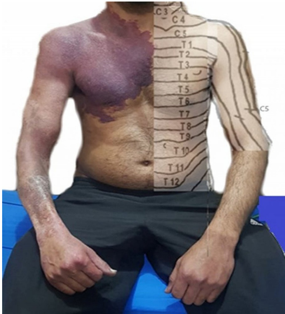
FIGURE 1: The large erythematous dusky raised red plaque with a bluish hue on the right upper trunk and arm involving C3 to C6, T1 to T5 dermatomes, and associated with distal forearm wasting. The anatomic depiction of corresponding dermatomes is done on the contralateral side for accurate picturization and comparison.

To further evaluate the etiology of this chronic dorsal myelopathy, a decision to obtain imaging was made. CT imaging showed coarse trabeculations, corduroy cloth appearance of the involved vertebra, consistent with the classic "jail-bar" sign highly suggestive of an intra-osseous hemangioma (Figure 2). To definitively assess this lesion, MRI with contrast was undertaken next, which revealed a patchy, heterogeneous epidural soft tissue mass extending into neural foramina, causing compression of thecal sac and cord. This tumor occupied most of the vertebral bodies between C7 and T10, involving pedicles, laminae, and the base of the transverse processes (Figure 3).