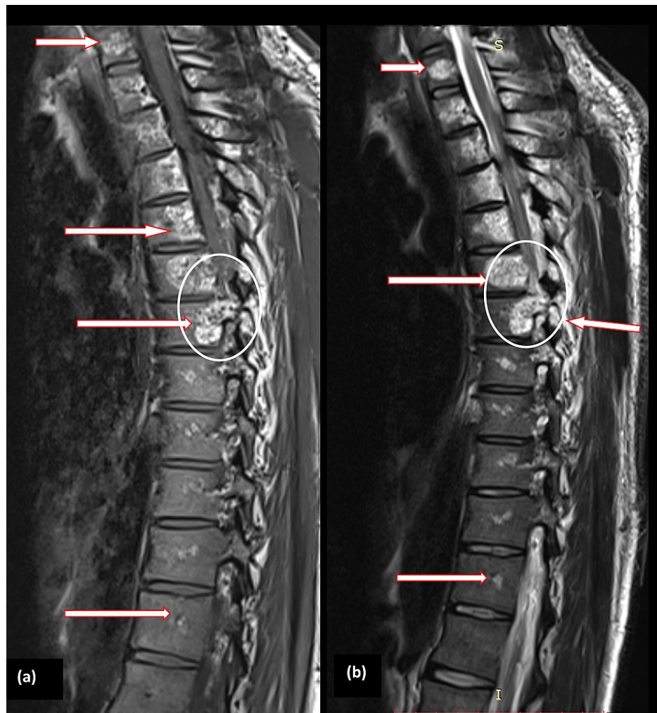
FIGURE 3: Sagittal views of MRI with contrast showing involvement of 13 vertebrae (marked with arrows in several places in both images (a) and (b)) from C7 to D12 with spinal cord compression (circled).

The patient reported worsening of symptoms in the subsequent days. In view of worsening spastic paraparesis with bladder and bowel involvement, the decision was made for him to undergo urgent decompression surgery. Cervical cord laminectomy from C7 to T4 with decompression of extradural hemangioma was done. The excised tissue was sent for the microscopic examination, which revealed large dilated and thin-walled vascular channels filled with blood and lined by flattened endothelial cells, along with intervening stroma of loose fibrotic tissue. This was consistent with our final diagnosis of cavernous hemangioma. The postoperative course of our patient was uneventful, and his spasticity improved, and his power gradually returned to a near-complete recovery. He was discharged after four weeks of extensive physiotherapy. He was consistently followed up in our specialized neurology clinic. On his most recent follow-up, three months after surgery, he was able to ambulate independently without any difficulty and reported a significant improvement in quality of life.