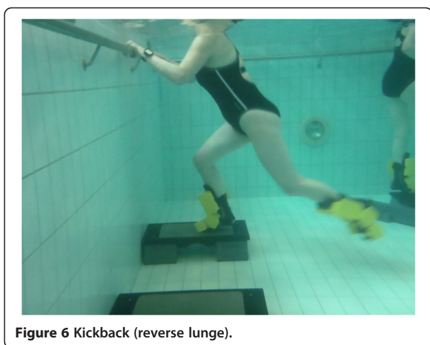
Figure 6 Kickback (reverse lunge).

work of 30 and 45 seconds with large boots. Week 12 will consist of one session barefooted, one with small fins and one with large boots, work duration will be 45 seconds per set. The frontal area of aquafin resistance fins is 0.0181 m 2 and that of the large resistance boots 0.075 m 2 . In a previous study the drag experienced during seated aquatic knee flexion/extension exercises in healthy women was triple with the large boots compared to the barefoot condition. Additionally, a significant increase in EMG activity was seen with the large boots compared to no boots [117,122].