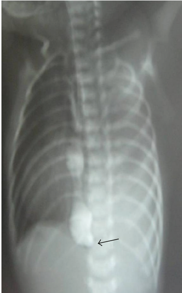
FIGURE 1: Contrast esophagogram showing holding up (arrow) of contrast at the level of the diaphragm with evidence of CDH with lower esophageal obstruction.