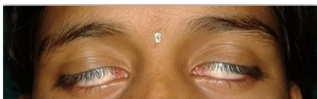
Figure 1. Photograph showing positive Bell's sign.

protein levels (24.0 mg/dL), glucose levels (3.6 mmol/L), chloride levels (120 mmol/L) and culture was negative after 60 hours of incubation, and India Ink staining did not show any morphological forms which could indicate Cryptococcal infection. Enzyme Linked Immunosorbent Assay (ELISA) for JEV (Japanese Encephalitis Virus) was negative. Plain Magnetic Resonance Imaging (MRI) (GE Signa Excite™ 1.5 T Scanner) of brain was normal with no compression of the cisternal segment of bilateral facial nerves on axial sections (Figure 2). Audiological evaluation suggested that the hearing sensitivity was within the normal range in both the ears. Minor salivary gland tissue biopsy did not reveal features of Sjogren's syndrome.