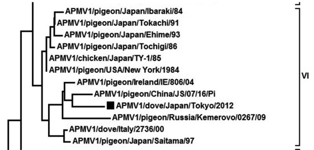
Fig. 8. Higher magnification of a part in Fig. 7. The present strains are most close to Chinese strain “APMV1/pigeon/China/JS/07/16/Pi”.