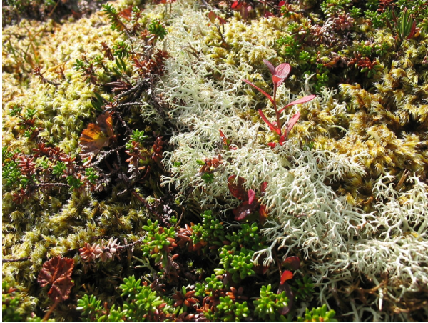
Figure 1. Vegetation on Andøya island, Norway, showing examples of subarctic species tested here for nutrient resorption efficiency in the Subarctic, as representatives of contrasting clades: mosses ( Racomitrium lanuginosum ), lichens ( Cladonia stygia ) and several vascular plant species (including Empetrum nigrum , Vaccinium uliginosum , Rubus chamaemorus , Andromeda polifolia ). Photo by Marc Roßkopf.

18°49'E), but also on Andøya, Norway (69°07'N, 15°52'E) and in Kilpisjärvi, Finland (69°03'N, 20°50'E). The lichen Cladonia stellaris was sampled in the Altai Republic, S Siberia (51°04'N, 85°45'E) in 1999 and stored air-dry. We focused mainly on abundant species (see also Lang et al. 2009). We searched for patches large enough to allow for later nutrient analysis. Samples were taken where they were abundant, that is, where they showed optimal growth. At a given spot, several patches or several single specimens (depending on growth habit) were taken and pooled. For the vascular plants, we used an existing database, for which common species were sampled from the predominant ecosystems within 10 km from Abisko in 1998 and 1999 (Quested et al. 2003). As in the vascular plant dataset, no P was measured, and we took RE P for six eudicots in the Abisko region from Van Heerwaarden et al. (2003b). Together these species were representative of the European subarctic region. For nomenclature see Lang et al. (2009).