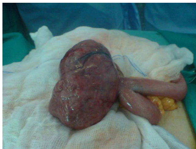
Figure 3 The well-circumscribed lesion of the jejunum before its removal.

The term GIST was introduced by Mazur and Clark in 1983 in order to indicate a distinct heterogeneous group of mesenchymal neoplasms of spindle or epithelioid cells