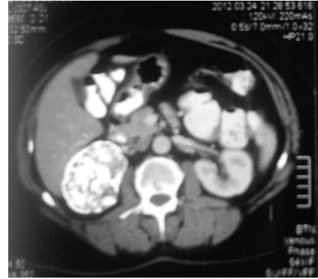
FIGURE 1: A 49-year-old female patient who had a cT2 mass in her right kidney. She was operated through the open route under warm ischemia. Final pathologic diagnosis was Fuhrman grade 2, clear cell RCC, pT2a.

A total of 17 patients with clinical T2 renal masses (>7 cm) have undergone nephron-sparing surgery between 2001 and 2012, at our institution. Thirteen patients (76.4%) were treated through the open route (Figure 1), while 4 patients (23.5%) were managed by RANSS (Figure 2). Mean age of the study population was 49.8 \pm 11.3 years (range = 30–66). Male to female ratio was 1.42 (10/7). Mean ASA score of the operated patients was 1.1 \pm 0.39 (range = 1–3). The majority of the tumors were discovered incidentally ( n = 11 , 64.7%). NSS was offered based more commonly on elective indications.