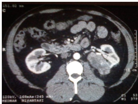
FIGURE 3: A 51-year-old male patient with a cT2 mass located on the posteromedial aspect of the left kidney. His operation was initiated in a minimally invasive fashion. However, open conversion was necessary because of the size and posterior location of the tumor. Final pathologic diagnosis was Fuhrman grade 2, clear cell renal cell carcinoma, pT2a.

tumors had R.E.N.A.L. scores of 9 and 10, respectively (Figure 3).