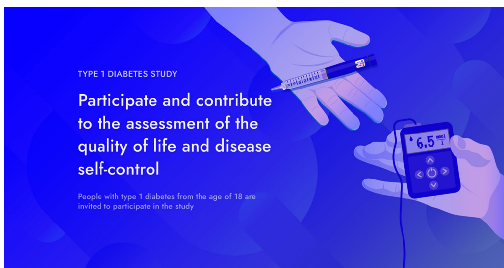
Fig. 1 Visual engagement material used in study invitations

All questionnaires were available in the two main languages in use in Latvia – Latvian and Russian. Translation and back translation of questionnaires were performed by two independent professional translators.