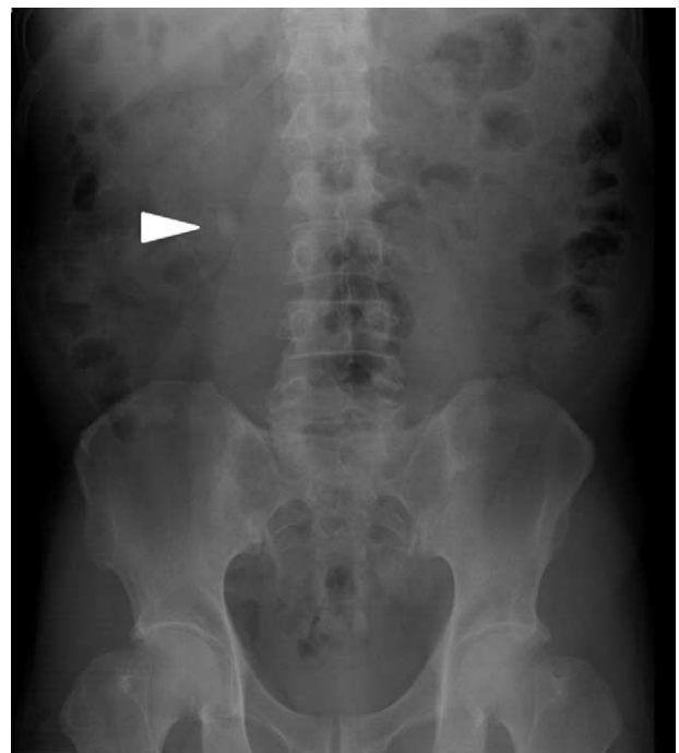
Figure 2. Abdominal radiograph on initial presentation. An abdominal radiograph of the patient on initial presentation showing a radio-opaque calculus with a longitudinal diameter larger than 10 mm in the upper portion of the right ureter (arrow head).