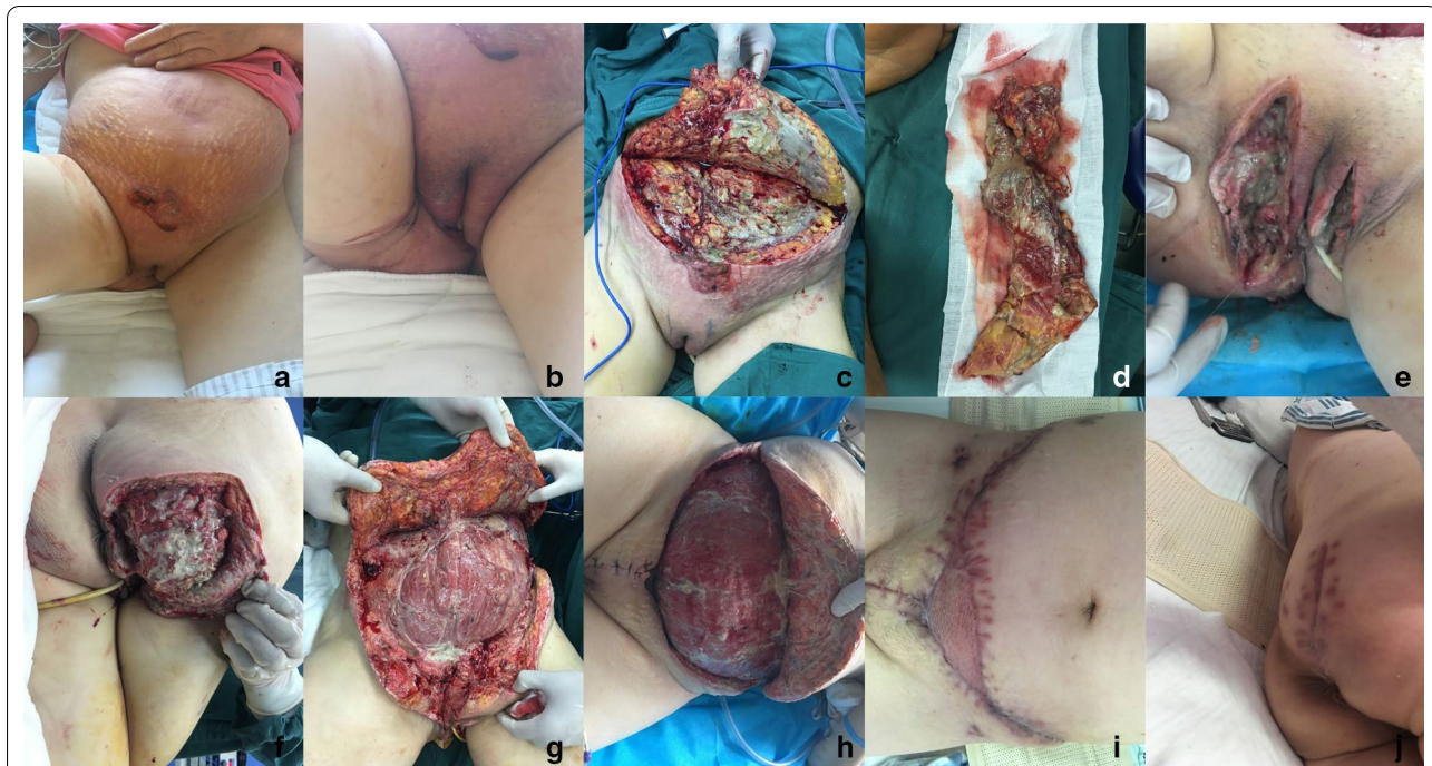
Fig. 2 a Clinical manifestation after admission in abdomen view; b clinical manifestation in perineum view; c emergency surgical debridement was performed to control the invasive infection that involved the subcutaneous tissue and fascia, but muscle involvement was not obvious; d the excised necrotic tissue; e wound in perineum; f wound in right buttock; g repeated debridement was performed on the 5th day after admission; h wound bed manifestation after NPWT; i abdominal wound was closed by secondary suture and skin graft; j wound in right buttock was closed by secondary suture

performed on the following 5th and 11th days to remove the residual necrotic tissue and to culture the wound bed (Fig. 2f, g). Other treatments included parenteral nutrition support (25–30 kcal/kg/day) and blood transfusion. Moreover, granulation tissue was raised with a fixation of NPWT (Fig. 2h). For wound closure, the wounds in perineum, right buttock and partial abdomen were sutured, while skin graft was used to cover the residual defect in abdomen (Fig. 2i, j). The patient was discharged on the 29th day after admission and no relapse was observed.