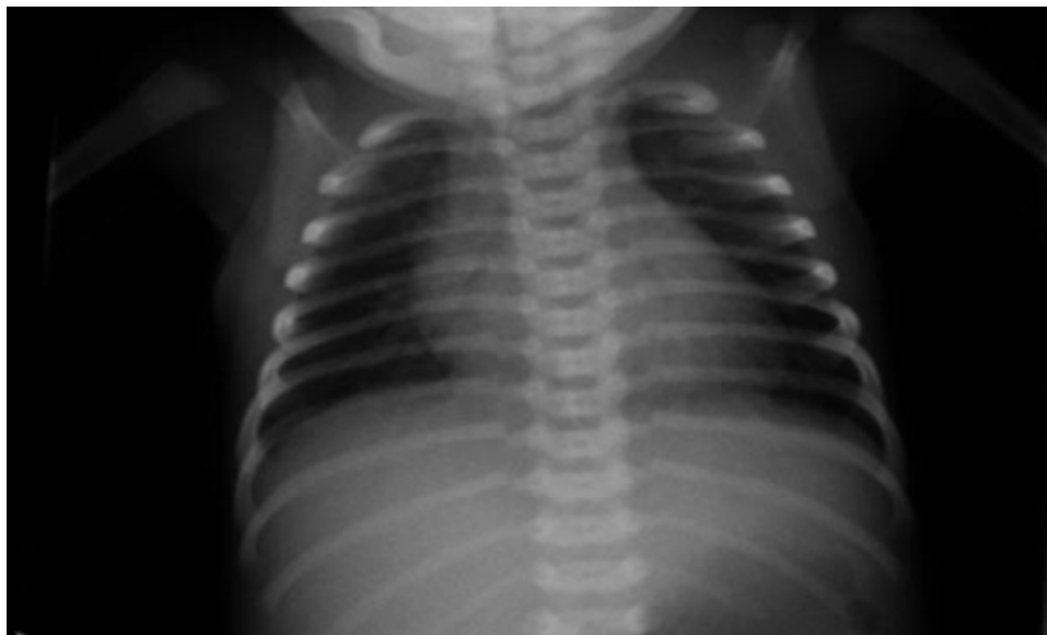
Figure 1 Chest radiograph showing clear lung fields without any evidence of parenchymal lung disease suggestive of idiopathic persistent pulmonary hypertension of the newborn or “black lung disease.”

noted to be 79 to 80% with a loud systolic murmur heard over the left heart border, which had not been previously documented. She had an arterial blood gas with a pH of 7.38, P_{aCO_2} of 44 mm Hg and a partial pressure of oxygen ( P_{O_2} ) of 47 mm Hg on 40% oxygen with an A-a gradient of 182 mm Hg. A hyperoxia test in 100% oxygen raised her P_{O_2} to 372 mm Hg.