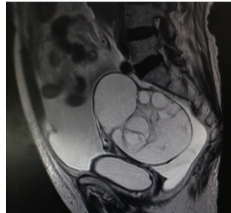
FIGURE 3: MRI image of patient 3 before operation.