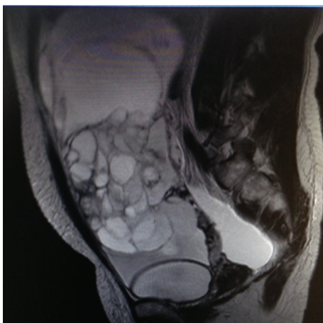
FIGURE 2: MRI image of patient 2 before operation.

2.2. Case 2. A 47-year-old woman felt a fullness (distension) of her abdomen before consulting a gynecologist. She was diagnosed with a pelvic tumor by CT scan and was sent to our hospital for medical treatment. The maximum diameter