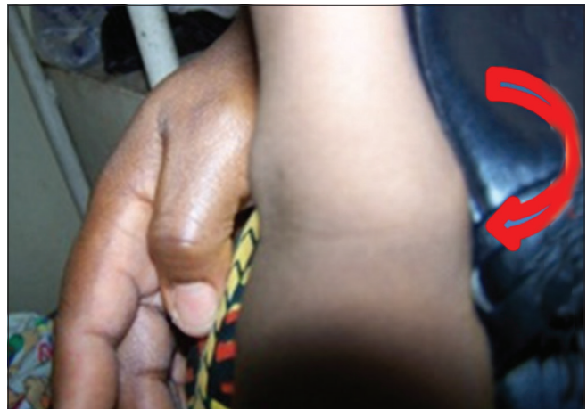
Figure 4: Child's right wrist joint showing swollen wrist