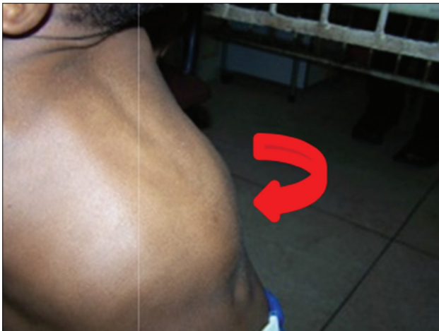
Figure 3: Child's chest posteriorly showing gibbus and kyphosis