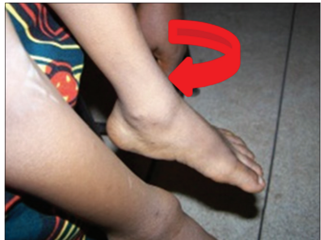
Figure 6: Child's left ankle joint showing swollen left ankle