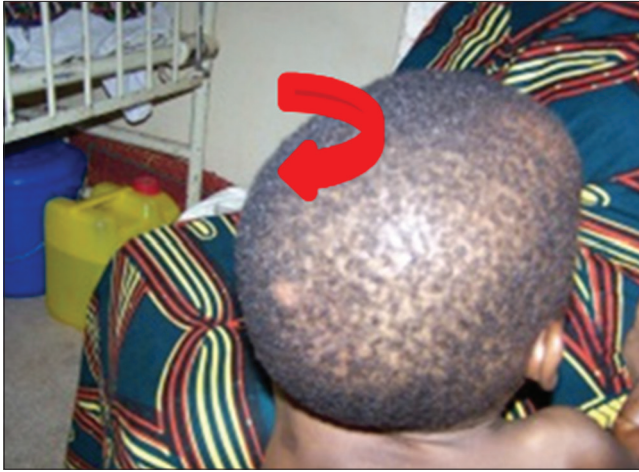
Figure 1: Child's head posteriorly showing caput quadratum

The patient had been managed for as long as 1 year as a case of rickets with no remarkable response to therapy. This was probably due to the skeletal abnormalities with short stature, highlighting the need for a high index of suspicion and extensive laboratory backup.