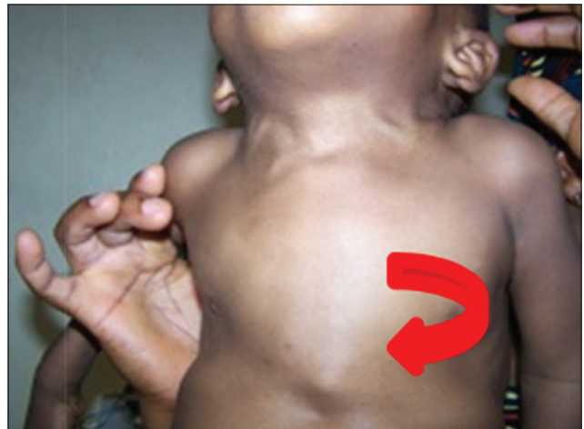
Figure 2: Child's anterior chest showing anterior chest deformity