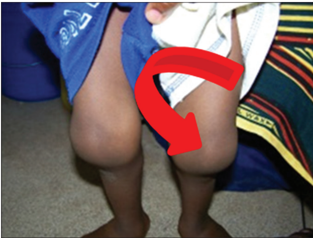
Figure 8: Picture of child's knees showing bilaterally swollen knee joints