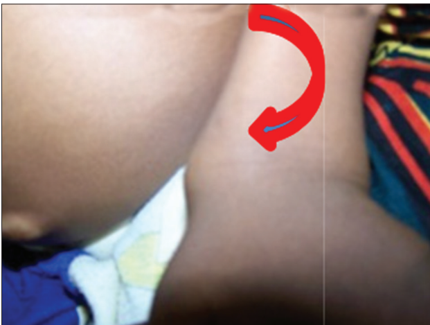
Figure 5: Child's left wrist joint showing swollen wrist