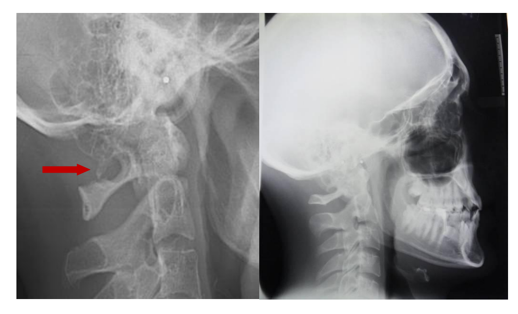
Fig. (3). Detail of cephalogram showing partial type ponticulus posticus on the left, and cephalogram showing a partial ponticulus posticus in a patient with agenesis of 35.