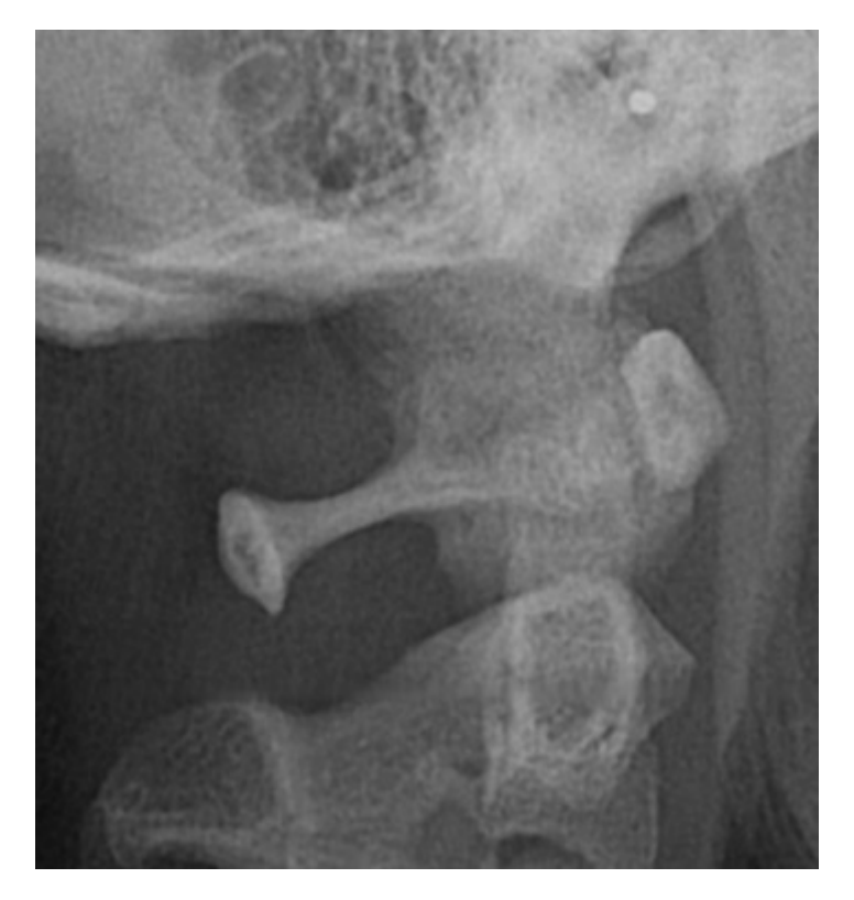
Fig. (2). Detail of a normal atlas as viewed on lateral cephalogram.

The direct inspection of the 350 lateral cephalograms (Fig. 2) has lead to find a prevalence rate of 32,95% for both the types complete and partial ponticulus (Table 2), the presence of calcified type has never been observed. A slight male predominance without statistical relevance has been observed ( \chi square test = 0.09; p value= 0.76) (Table 3).