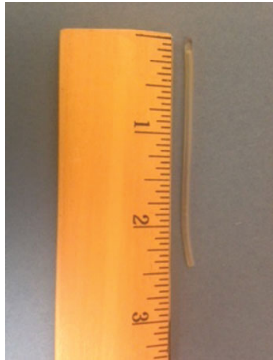
Fig. 3 Removed suction catheter.

The infant was doing well upon admission and did not require mechanical ventilation. The vital signs were as follows: O 2 saturation (SpO 2 ) 93 to 100%; heart rate 149 to 190 beats/min; respirations 30 to 88 breaths/min; blood pressure systolic 52 to 73 mm Hg and diastolic 29 to 47 mm Hg. However, a retained suction catheter was evident on imaging with the upper proximal end beginning at the level of vocal