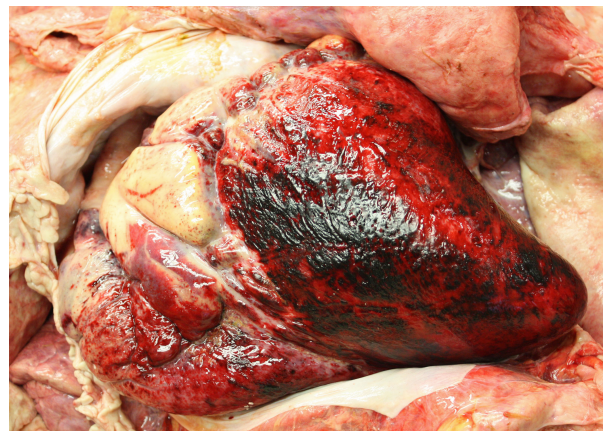
Figure 1 Epicardial haemorrhages. Severe multifocal to coalescing epicardial haemorrhages in the water buffalo cow with MCF. The pericardium contained 1,5 liters of serous fluid (evacuated).

The major histological finding was a mild to moderate lymphohistiocytic vasculitis in the brain, in the carotid