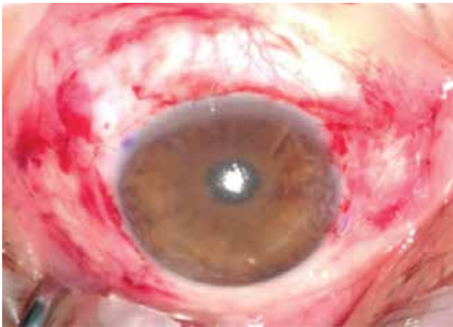
Figure 2. Photograph of case 2 after pterygium surgery with conjunctival autograft

6-21 months) and there were no recurrences. Histopathologic findings from all excised tissue were consistent with pterygium. All patients reported working at least 5-6 hours per day under the sun during the hottest part of the day, or in the case of a restaurant worker, in front of a fire; homemakers worked in their own gardens or in greenhouses. The rate of cigarette use among the patients was 62.5%. The demographic and clinical characteristics of the patients are presented in Table 1.