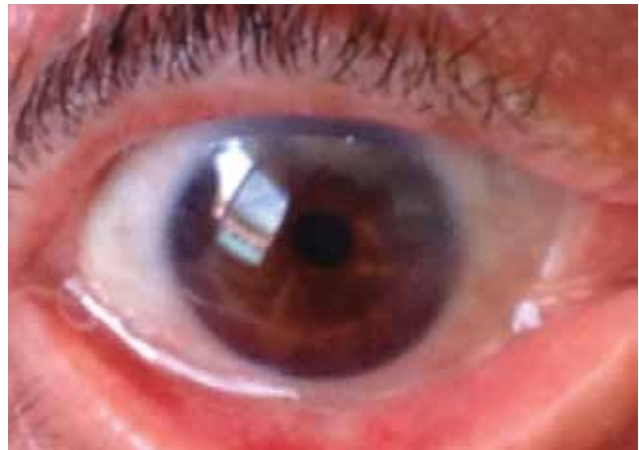
Figure 3. Photograph of case 2 at 3 month follow-up

Pterygium is more common in hot climates. Turkey, especially its Mediterranean region, has the climatic conditions and environmental features that factor in pterygium etiopathogenesis, so pterygium is an important ocular surface disease frequently encountered in our clinic. Despite being a very common ocular pathology, temporal pterygia are quite rare. 13 The role of pterygium in the development of squamous cell neoplasias is not clear; therefore, excisional biopsy to rule out squamous cell neoplasia should be performed, especially with