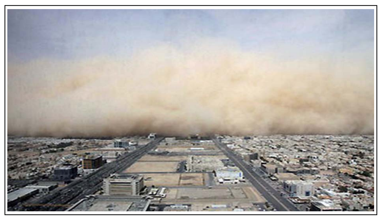
Fig.1: A Sandstorm approaching Riyadh, Saudi Arabia.

A day after the sandstorm, the co-authors visited various schools, colleges and university hospitals in Riyadh, Saudi Arabia. They distributed the