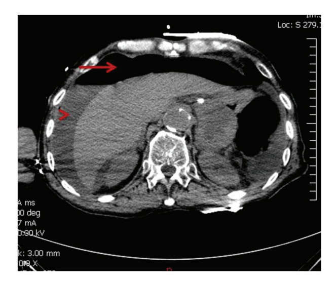
Figure 2. CT showing moderate pneumoperitoneum (arrow) and perihepatic fluid (arrow head).

therapy treatment with 5-fluorouracil and oxaliplatin using the following regimen as recommended in NCCN guideline [10]: oxaliplatin 85 mg/m² IV on day 1, leucovorin 400 mg/m² IV on day 1, 5-fluorouracil 400 mg/m² IV push on day 1, 5-fluorouracil 800 mg/m² IV continuous infusion over 24 h daily on days 1 and 2. The regimen is cycled every 14 days for three cycles with radiation and three cycles after radiation. The patient tolerated the chemoradiotherapy very well and during the first week of treatment, his appetite improved.