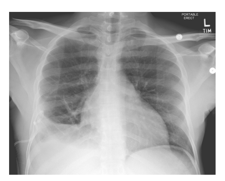
Figure 3 Chest X-ray prior to discharge showing decrease in effusion size.

The patient ultimately had a chest tube placed in his right lung in order to drain his pleural effusion. Over the course of 5 days, his effusion was drained through his chest tube, and repeat chest X-rays taken showed improvement of the effusion size (figure 3). The chest tube was clamped and then removed prior to discharge. The patient was recommended to follow-up with