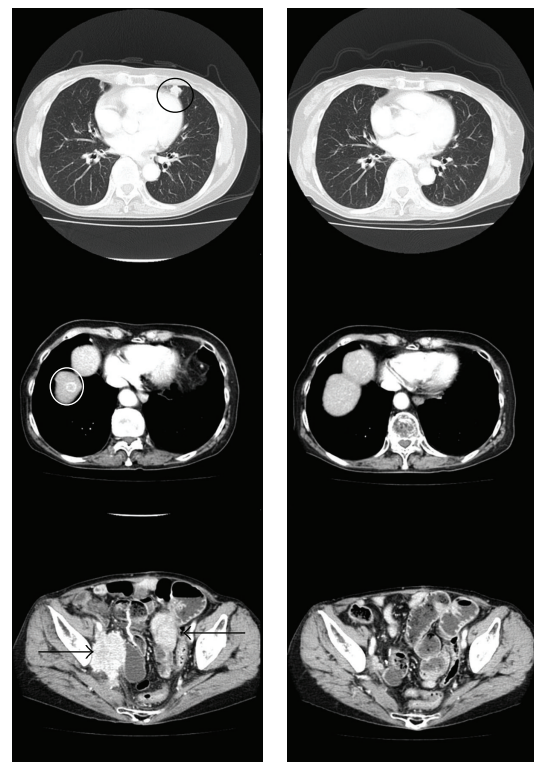
(a) Pretreatment CT showing a 13.4 \times 11.8 mm metastasis in the lingular superior of the left lung (black circle) and a 12.0 \times 11.1 mm metastasis in segment VIII in the liver (white circle), pelvic, para-aortic lymphadenopathy, and mesenteric nodes collectively measuring 43.1 \times 61.6 mm (arrow)

The authors declare no conflict of interests.