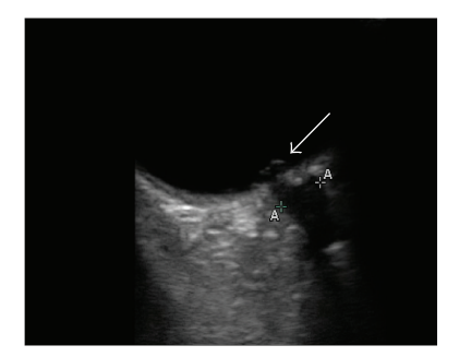
FIGURE 1: Bedside ocular ultrasound of the right eye demonstrating bulging of the optic nerve cup, indicative of papilledema.