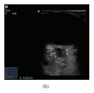
FIGURE 3: Bedside ocular ultrasound of left (a) and right (b) eyes, showing measurement of optic nerve sheath diameter. Measurements are 5 mm and 5.2 mm, respectively.