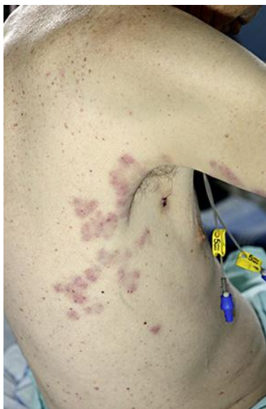
Fig. 2. Dry, non-scaly, round and well-delimited violaceous plaques on the right upper back. The site of the biopsy is shown.