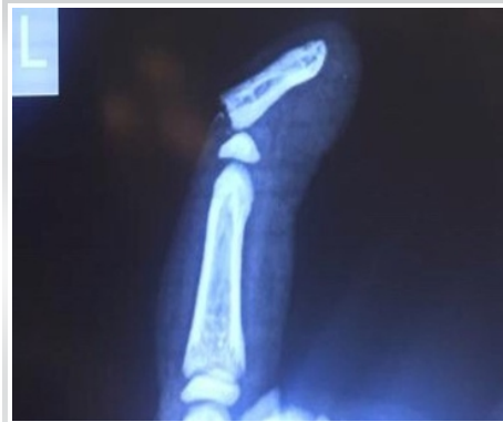
Figure 2: Lateral radiograph suggesting Salter-Harris Type I Physeal injury of the distal phalanx.