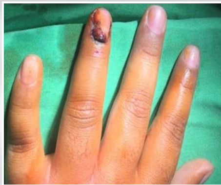
Figure 1: Avulsed nail bed injury of the left ring finger with flexion deformity.