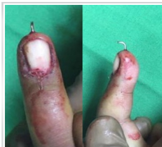
Figure 4: Nail bed sutured with 3-0 monofilament suture material.

The distal phalanx is closely attached to the germinal matrix and the overlying skin; hence, any amount of injury to the nail bed is bound to cause injury to the physis. The extensor tendons are attached to the epiphysis and the flexor tendons are attached to the metaphysis.