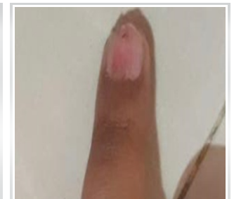
Figure 7: Well formed nail without any deformity at 1-year follow-up.