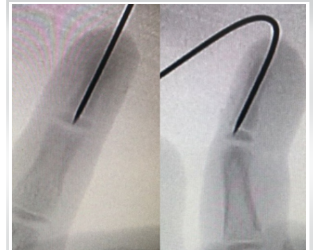
Figure 3: The distal phalanx physeal injury reduced and fixed with k-wire passing through the tip of the ring finger, metaphysis, physis, and entering the epiphysis.

suturing of the nail bed and to discuss the differential diagnosis of this rare injury.