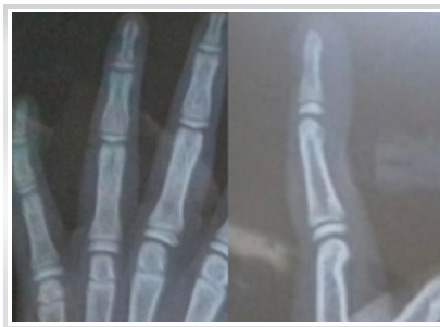
Figure 5: Radiograph at 3 months showing healed physeal injury of ring finger distal phalanx.