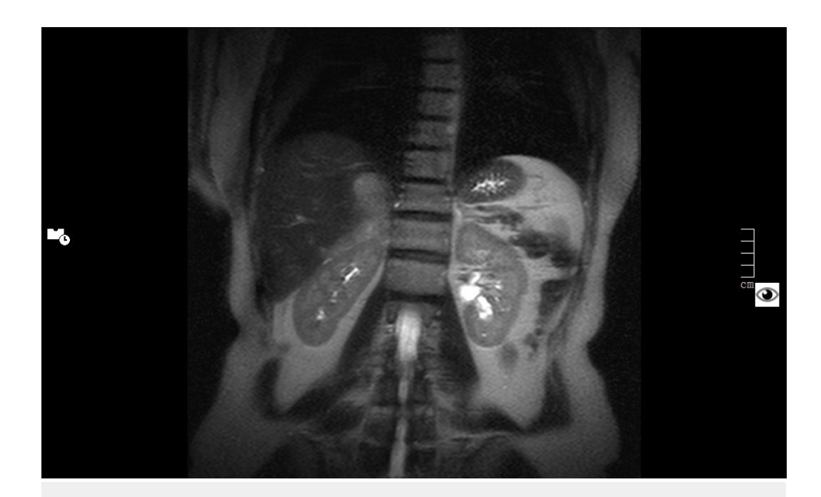
FIGURE 2: Metastatic spread of pheochromocytoma in right liver lobe, right kidney, and right hemidiaphragm in abdominal MRI

The patient denied abdominal pain and remained asymptomatic. At this point, the patient was referred to our Hypertension Clinic.