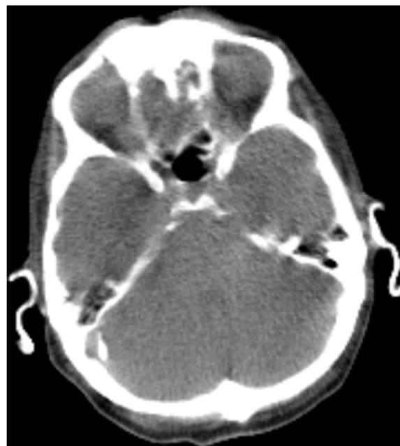
Figure 1 Computed tomography scan of the cerebrum displayed fully calcified auricles.

Calcification of the auricles is described in many forms and multiple terms are used for this heterogeneous