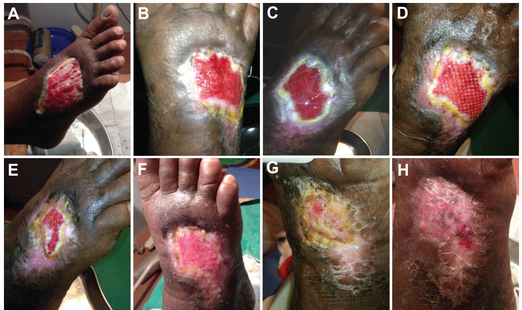
FIGURE 1: Epidermal grafting in a diabetic foot ulcer previously unresponsive to two years of treatment with standard wound care dressings.

A. Wound at presentation. B. Epidermal micrograft application. C. Wound at seven days post grafting. D. Micrograft islands observed at 14 days post grafting. E. Wound re-epithelialization at 20 days post grafting. F. Wound at 27 days post grafting. G. Wound at 34 days post grafting. H. Wound completely healed at 40 days post grafting.