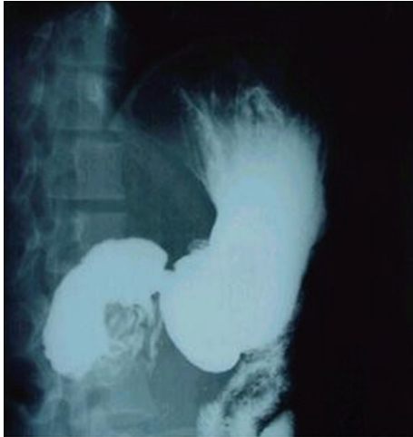
FIGURE 1: Upper GI series showing cut-off area between the second and third parts of duodenum.