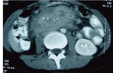
FIGURE 3: Abdominal computed tomography showing an 8 × 5 × 7 cm heterogeneous lesion with indefinite borders invading to the proximal part of small bowel in retroperitoneal space.

Our primary differential diagnosis was retroperitoneal lymphoma, GIST, or desmoid tumor. Patient underwent surgery. Laparotomy was performed and a large fragile mass