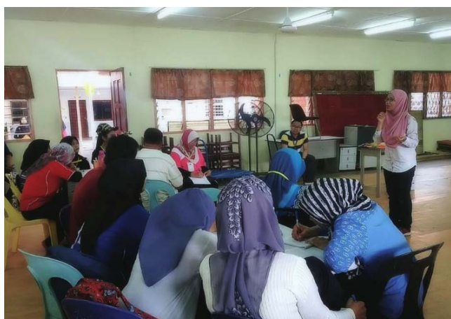
Figure 3. Knowledge sharing between trainers and the community volunteers in one of the training workshop sessions.

One unique distinguishing factor of this developed training module is that it places additional emphasis on psychological issues, which are not prioritised in the IMCI framework. Psychological stigma towards PTB has been a subject of interest not only to healthcare professionals but also to governing authorities. Casual transmission as a mode of contagion spread is one big factor within public stigma towards TB. 16 This stigma can be ascribed through three attributes; controllability (one's aptitude for controlling tuberculosis from infecting others), responsibility (being responsible on the infection such as compliance towards treatment), and blame (accepting that the infection occurred due to own fault). 17 To alleviate such public stigma, it would be highly relevant to integrate psychological domains as part of the training module.