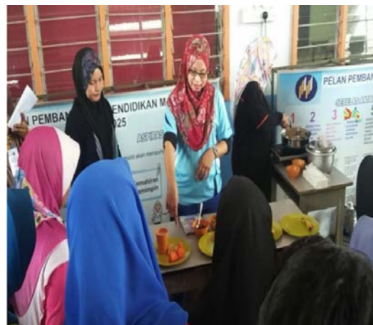
Figure 4. Healthy food preparation demonstration by the volunteers to the community.