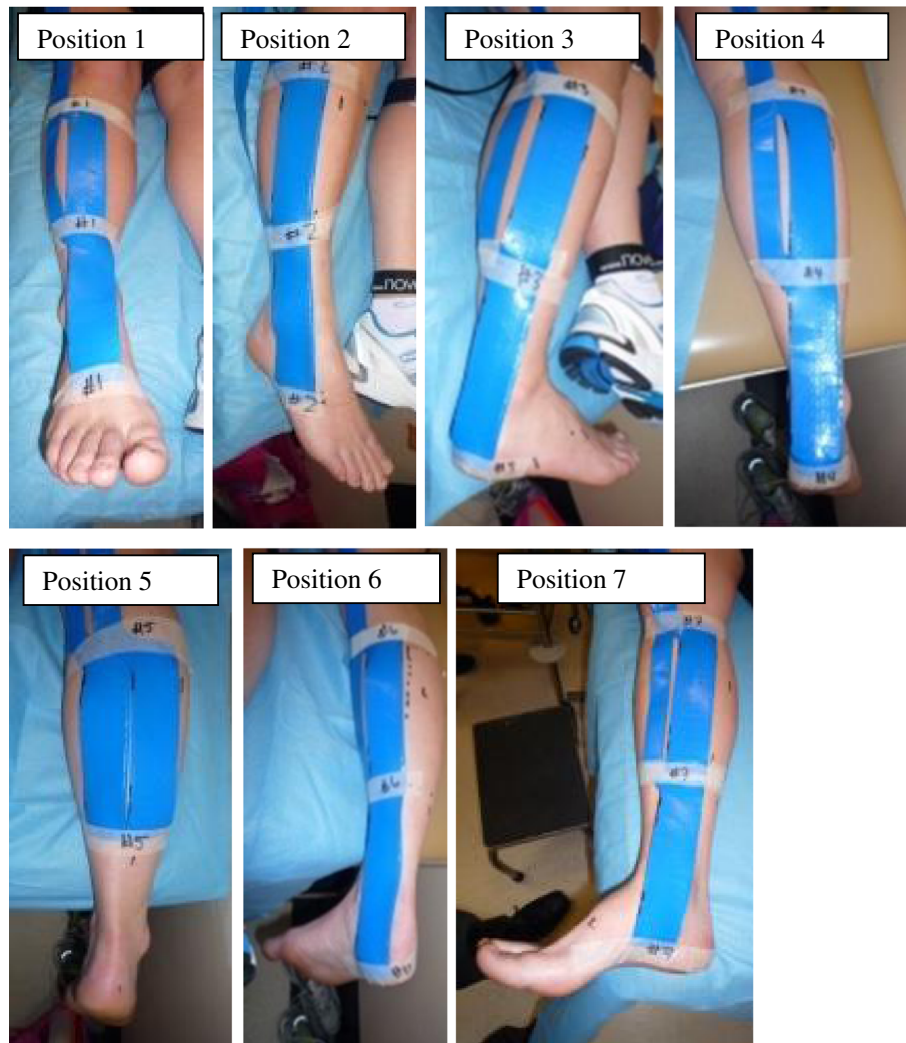
Figure 1 Orientation of sensors used to measure cast wall pressures at the seven different locations.

and cast wall data. The data from seven locations of the cast wall were synchronised for comparison at the same temporal events.