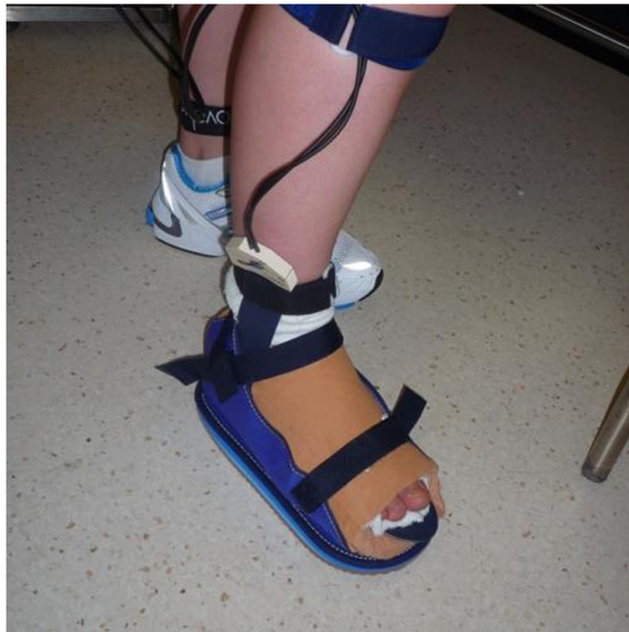
Figure 2 The shoe-cast condition. Cast walls were removed from the TCC leaving a well moulded shoe-cast condition.