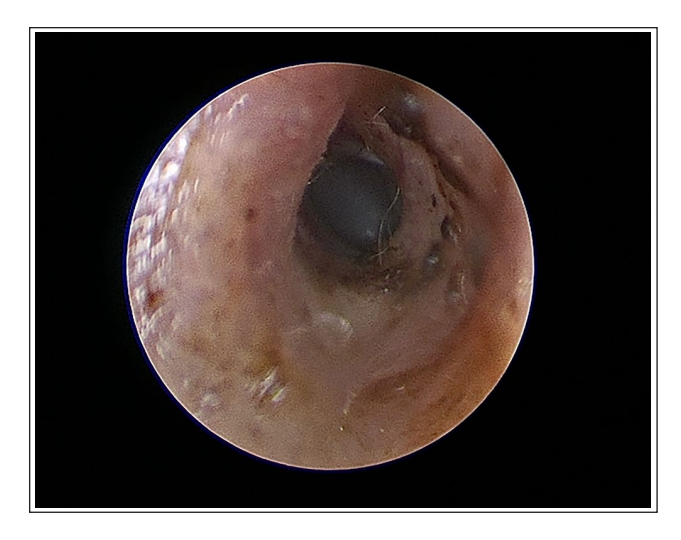
Figure 1 Video-otoscopic image of the right external ear canal showing otitis externa characterized by excessive cerumen and erythema of the canal wall

Treatment consisted only of sarolaner (5 mg)/selamectin (30 mg) topical solution (Revolution Plus; Zoetis) applied once monthly to the skin of the dorsal