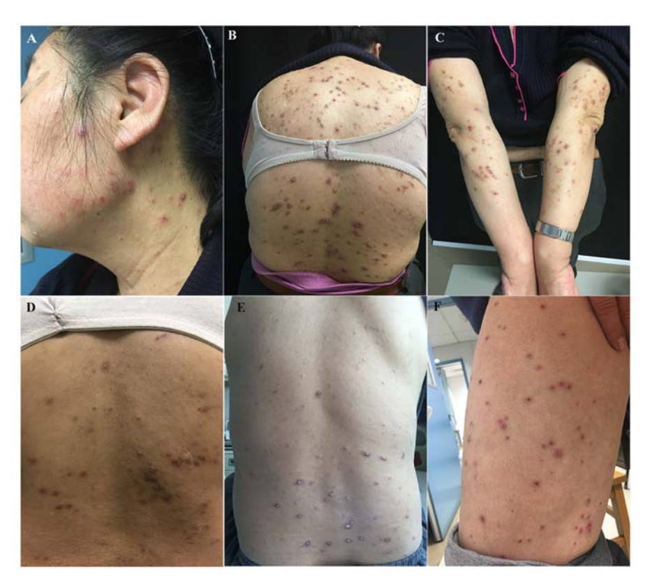
Figure 1. Presentation of acquired perforating dermatosis. The patient in case 1 presented with a large number of skin lesions and severe pruritus. (A) few papules on the face, (B) numerous umbilicated papules with central keratotic plugs on the trunk and (C) bilateral upper limbs with some papules in a linear arrangement, which were confirmed as Koebner phenomenon. (D) The patient in case 2 presented with few papules in the recovery period of APD and displayed several keratotic papules with central keratinous plugs on the back. (E) The patient in case 3 presented with a scattered distribution of well-defined keratotic papules on the back. (F) The patient in case 4 presented with a scattered distribution of papules and nodules with a central keratin-filled crater on the trunk.