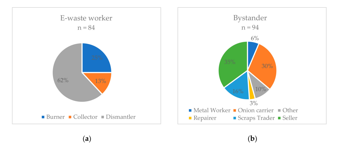
Figure 1. Job tasks of e-waste workers (a) and bystanders (b) (in percent of subgroups, total n = 178).