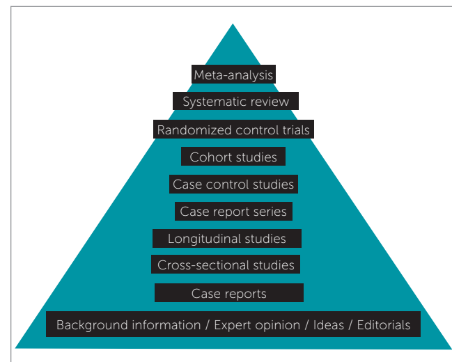
Figure 1 - The evidence pyramid.

The third item evaluates external validity, which pertains to the ability of results to be extrapolated to other people, places or situations. In order to ensure external validity, a random sample from a larger population is needed; should this not be done on a particular paper, multiple studies must