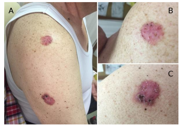
Figure 2: a), b) and c) Two nummular lesions (Fig. 2 b upper lesion, Fig. 2 c lower lesion) in the right brachial region, presenting as erythematous papules with sharp margins from the surrounding skin, gritty desquamation and dotted hyperpigmentations inside the lesion

When asked, the patient reported that he detected them several years ago and recorded discreet bleeding with mechanical trauma and crust formation over time, but the changes were also neglected, and he did not report them to a doctor before. A dermoscopy was initiated, which supported the initial suspicion of a cancer lesion.