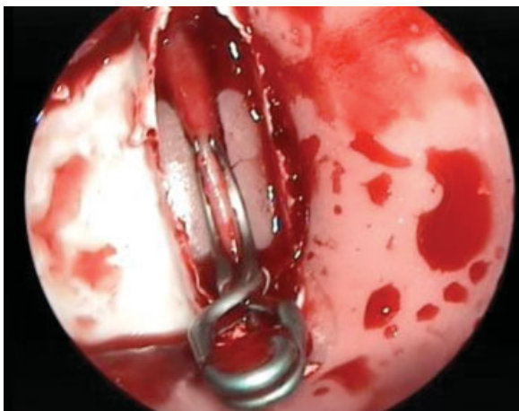
Fig. 3 T2 aneurysm clip (Mizuho, Tokyo, Japan) placement on carotid injury site.

Bipolar electrocauterization has also been described 2 ; however, long-term outcomes in a clinical setting are unknown. Padhye et al trialed bipolar electrocauterization on