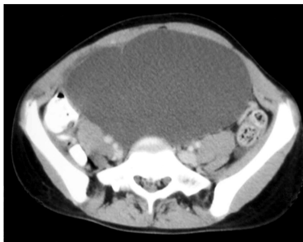
Figure 2. Computed tomography scan showing giant cystic lesion filling the entire abdominal cavity

Under general anaesthesia, with ultrasonographic guidance, a 10 F vesicostomy catheter was inserted into the cyst. Two to 4 l of serous (in one case mucinous) fluid were aspirated. Afterwards, a 10-mm trocar (camera port) was placed through the umbilicus by the open Hasson technique. Two additional trocars were inserted percutaneously in the right and left hypogastrium under direct vision. On laparoscopic examination a cyst originating from the left ovary in 1 case and the right ovary in 2 cases was seen. The cyst was excised, placed into the bag and removed through the umbilical incision. In all cases some ovarian tissue and ovarian tube was preserved. In all patients the contralateral ovary and uterus were normal.