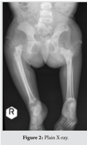
Figure 2: Plain X-ray.