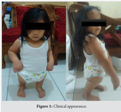
Figure 1: Clinical appearance.