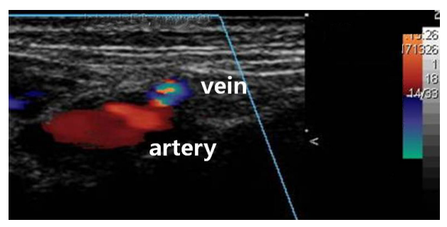
Fig. 1. An ultrasound scan of the right radial artery. An ultrasound scan of the right radial artery revealed suspicious turbulent flow, which suggested arteriovenous fistula or pseudoaneurysm.

An AVF is an abnormal connection or passageway between an artery and a vein. It may be congenital, surgically created for hemodialysis treatment, or pathologically acquired via trauma or erosion of an arterial aneurysm. An AVF results in a disruption of the normal blood flow pattern. Normally, oxygenated blood flows to tissues through arteries and capillaries. Following the release of oxygen, the blood returns to the heart in veins. In case of AVF, the blood bypasses the capillar-