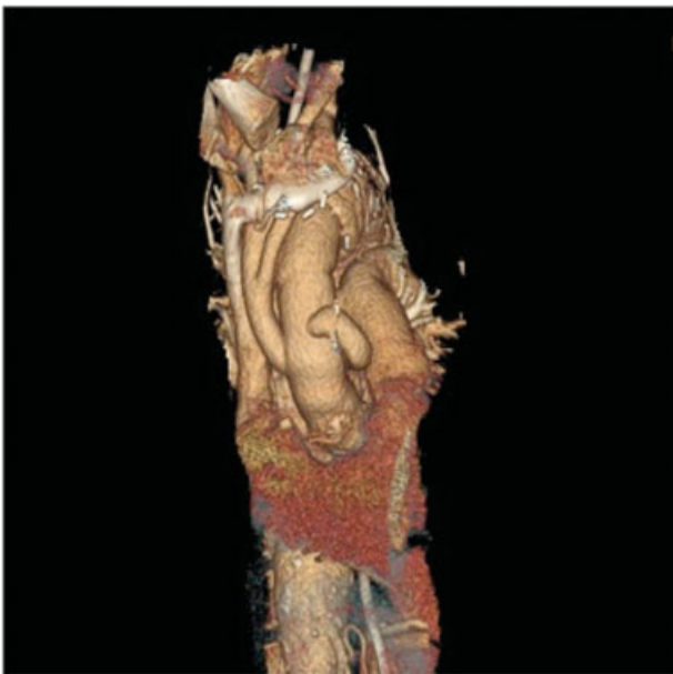
Fig. 2 Computed tomography—three-dimensional reconstruction image: The 10 mm prosthetic graft on this occasion is routed to the left side of the tube graft due to the presence of the trifurcated graft.