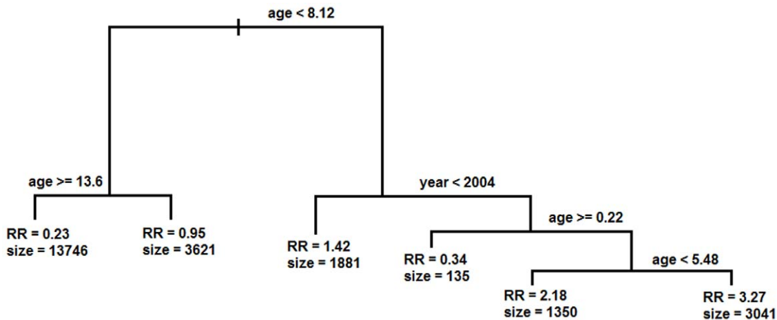
Figure 2. Decision tree generated by Classification and Regression Tree (CART) analysis of risk factors determining the occurrence of P. falciparum malaria attacks (PFA) per trimester. Figure shows the cut-off values identified by CART that divide the dataset into two. At each leaf are given the Relative Risk (RR) and the number of events associated with that leaf. doi:10.1371/journal.pone.0024085.g002

M.ref: reference model; Size: number of events; RR: risk ratio; OR: Odds ratio; \chi^2 : chi-square DF = 1; CL: confidential level. doi:10.1371/journal.pone.0024085.t010