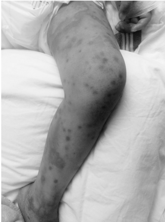
Fig. 1. Maculopapular lesions on the extremities of a pediatric patient with disseminated trichosporonosis.

amphotericin B liposome (16 mg IV daily) with monitoring of VCZ levels biweekly.