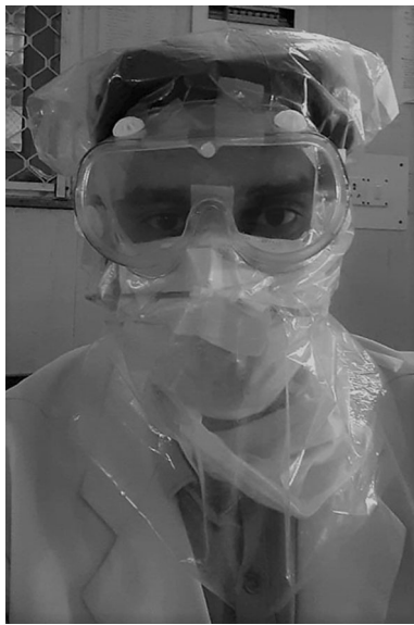
Fig. 3 Facial mask in position. Alternatively the routine surgical mask may be worn outside of the facial mask

the aerosol infection, and wearing such a device will increase this duration to many folds, thereby protecting the physician. The most important aspect is to create an airtight seal especially on the upper (facial) part of this design. The classical 3 methods known to check the affectivity of the mask-seal are user check seal method, qualitative fit testing (QLFT) and quantitative fit testing (QNFT). The United States Occupational Safety and Health Administration recognise both QNFT and QLFT as protocols to determine the fitness of mask. These days, QNFT is considered a gold standard in determining the fit