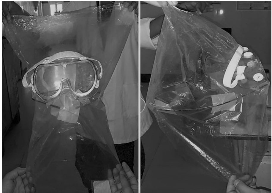
Fig. 2 anterior and the posterolateral views of the facial mask. A good quality plastic envelope is desired (transparent plastic sheet is used for better demonstration)