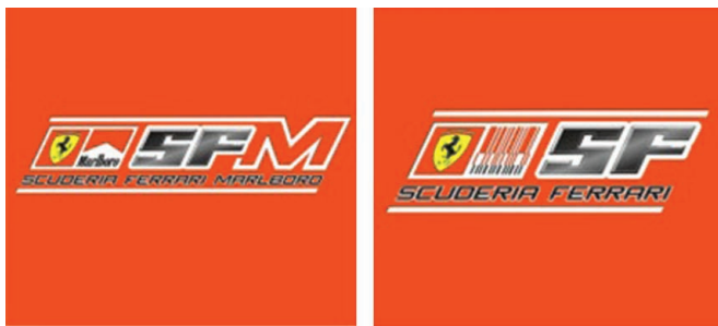
Figure 2 Ferrari F1 team names and logos, 2007 and 2010.

livery. This was to promote Philip Morris' new Marlboro Lights brand of cigarettes. The colour did not work on television and the experiment was never repeated. 33