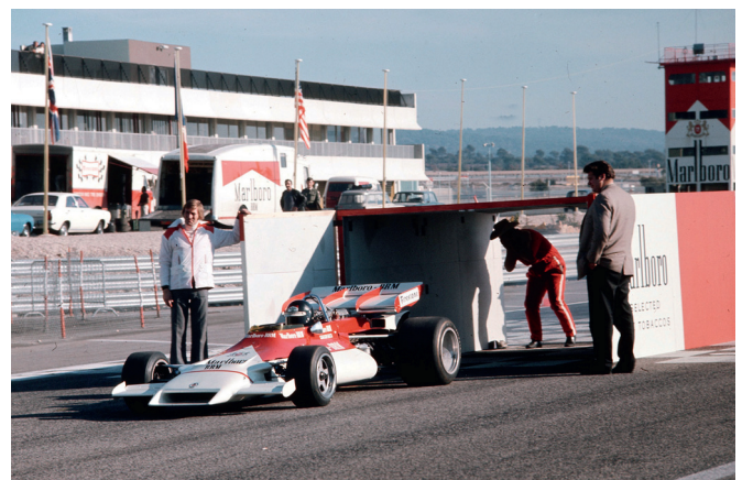
Figure 1 Marlboro branded BRM F1 car emerging from a mock-up of a giant Marlboro cigarette pack in 1972.

The Ferrari F1 team traditionally races in Italy's historic national motor racing colour, red. Philip Morris documents reveal that the company has long recognised the importance of association with Ferrari, and the red colour schemes shared by Ferrari and the Marlboro brand. Only once in F1 has Marlboro made use of a colour other than red, at the 1986 Portuguese F1 Grand Prix, when McLaren ran one car in a gold and white