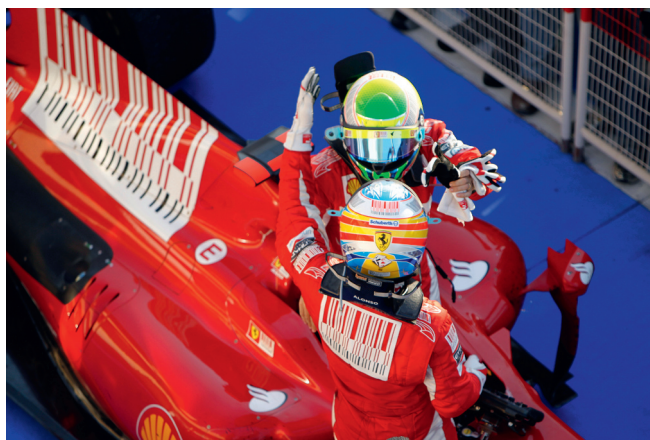
Figure 7 Marlboro 'barcodes' on both the Ferrari race car and the driver's clothing in early 2010.

techniques known as 'trademark diversification' and 'alibi marketing'. 61 Trademark diversification involves the use of a cigarette brand name on the branding of other and typically unrelated products, such as clothing. 62 Alibi marketing involves distilling a brand identity into its key components, such as the distinctive red and white colouring associated with the Marlboro brand, or the shade of purple used by Silk Cut, and using these to promote the brand in place of a conventional logo or trademark. 63 This study was carried out to assess the validity of Ferrari's assertion that barcode design displayed on their F1