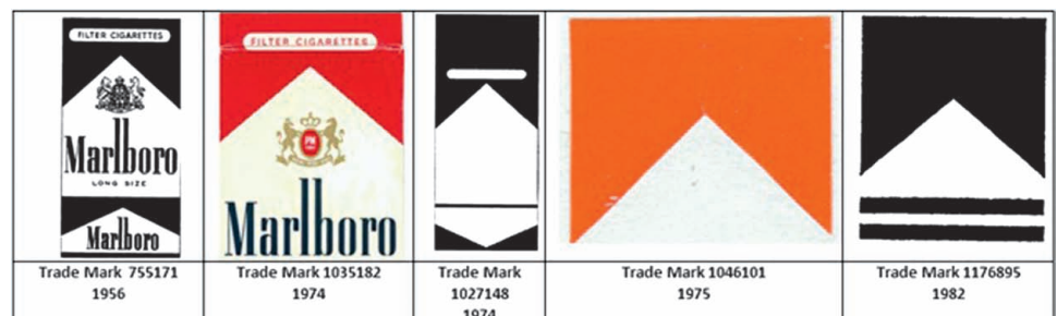
Figure 3 A selection of Philip Morris trademarks registered in the UK 1956–82.

When challenged by a series of media reports in early 2010 that the barcode design was in reality a Marlboro logo, Ferrari responded that 'the so called barcode is an integral part of the livery of the car and of all images coordinated by the Scuderia, as can be seen from the fact it is modified every year, and,