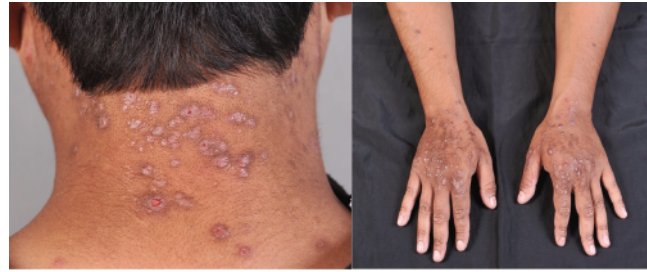
Figure 1. Clinical characteristics of adult-onset actinic prurigo.

AP differed between Asia, Europe/Australia and the Americas. 2-9 Asian patients with AP, including our study, had the highest mean age/age of AP onset (36.9-45.5 years), with a minority of cases occurring in women (5.3-40%).